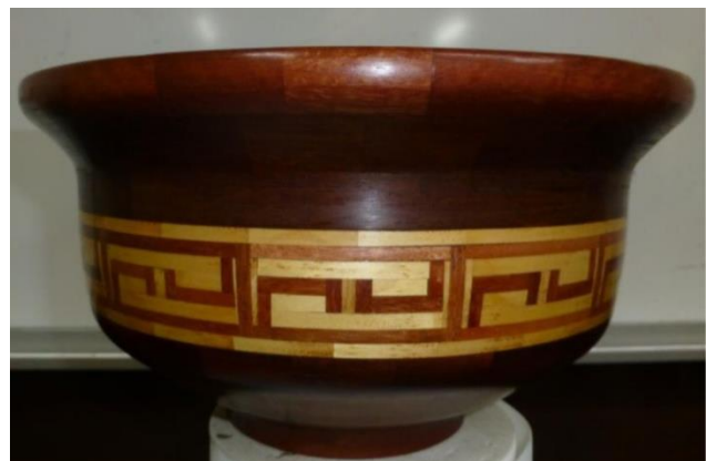
Syd's feature ring bowl