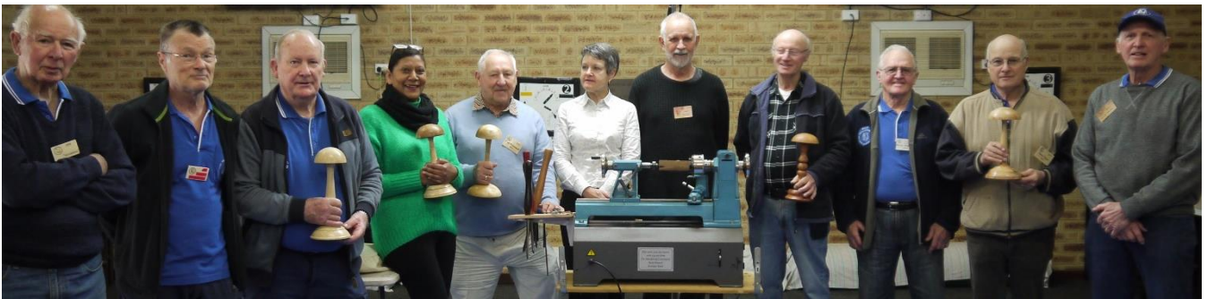
Some of the Swan Wood Turners with their wig stands

The idea behind our team challenges is to promote fellowship between our club members, develop the members turning skills and above all else in this case, produce something that could be donated to someone in the community. The end results are judged by a team of expert turners although this is not taken too seriously and only entitles the winning team to bragging rights. Not only did our club members participate enthusiastically in the team challenge and produce five wig stands on the day, but individual club members also produced another seventeen on their own lathes at home.