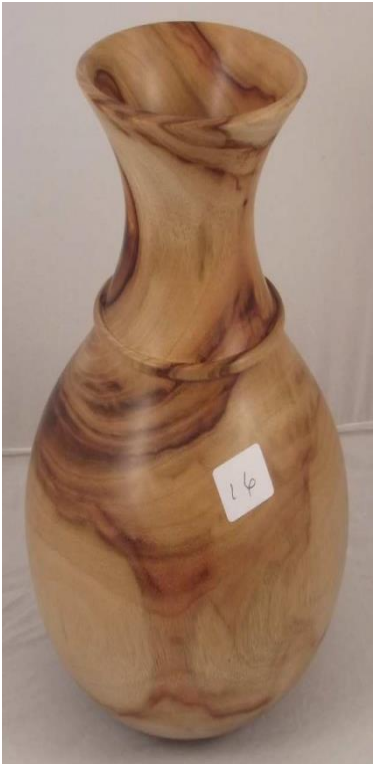
Hollow Form by Jock MacFadyen winner of Intermediate & equal Open competition sections at the October 2017 workshop