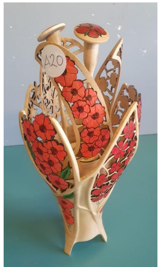
First Place Open Royal Show 2021