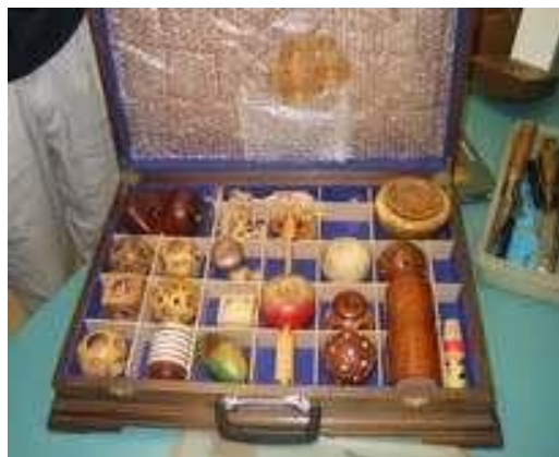
A small collection of Ken's magnificent work