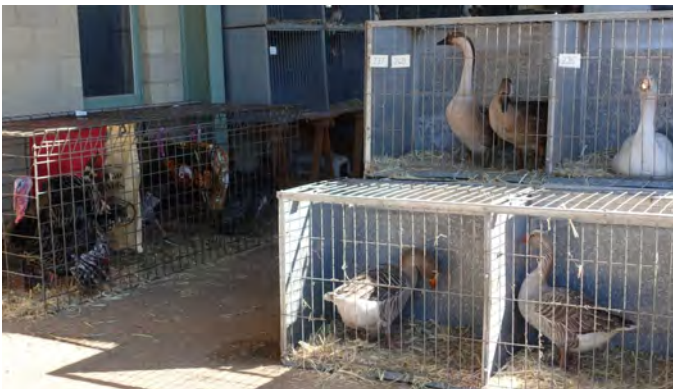
Our noisy neighbours