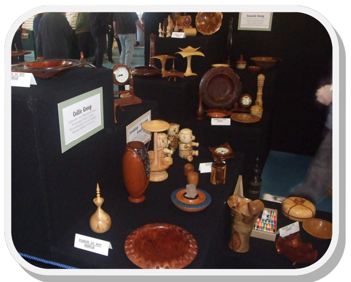
Above & Left 2014 Wood Show—WAWA Groups Display