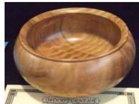
3rd Norm Gratte