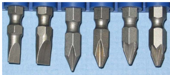
The photograph above shows the Slotted, Phillips and the Pozidriv drivers.

While the Phillips driver will normally work on a Pozidriv screws, Pozidriv drivers are likely to tear out the head of a Phillip screw because they cannot engage fully in the recess.