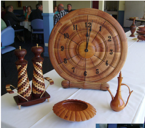
Selection of Items at the Christmas Windup