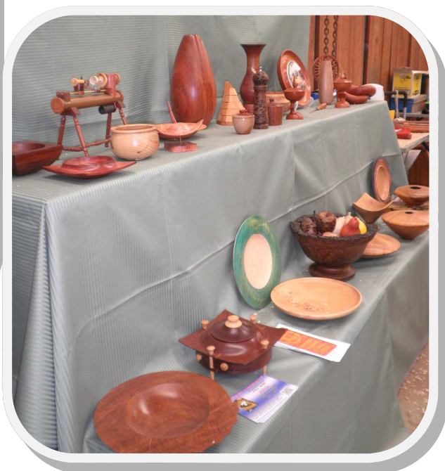
Display of items at Royal Show