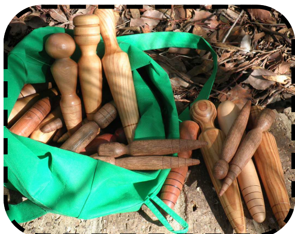
Garden dibbers ready for the nursery Avon Group