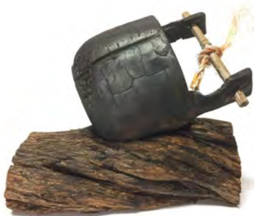
Jim Cameron—miner’s buckett