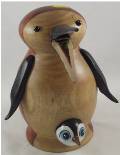
Some examples of the fascinating array of money box entries