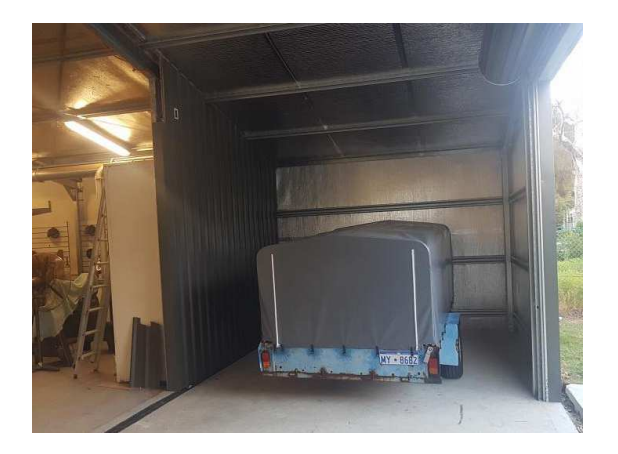
during gatherings and our large racking has moved into the new area provided.

There was a lot of work required by members after the shell was put up. Electrical alterations and the lining was completed ready for the painting. All that was done and now we are completing the equipment placement awaiting the phase two of our extractor system.