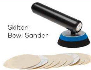
Skilton Bowl Sander