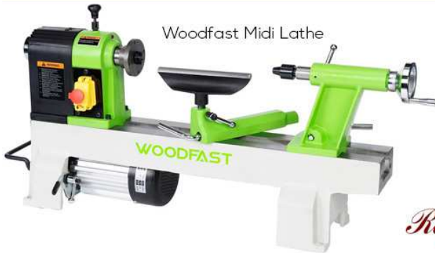
Woodfast Midi Lathe