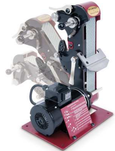
Robert Sorby ProEdge Sharpening System