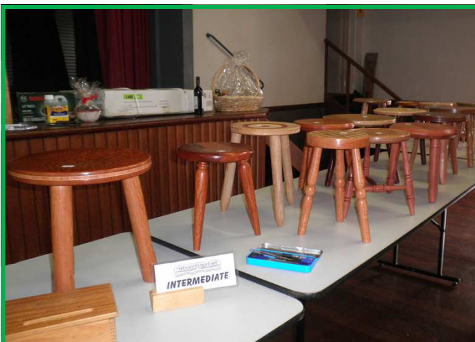
ABOVE: Some of the excellent display of 3-legged stools at Manjimup.