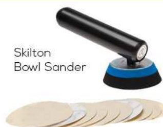
Skilton Bowl Sander