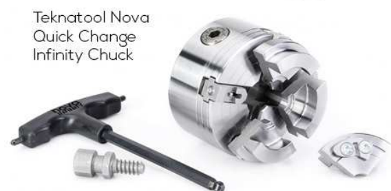
Teknatool Nova Quick Change Infinity Chuck