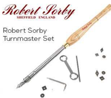
Robert Sorby Turnmaster Set