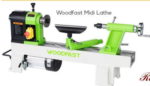
Woodfast Midi Lathe

168 Balcatta Rd, Balcatta WA 6021 P (08) 6143 5788 F (08) 6143 5789 www.carbatecwa.com.au