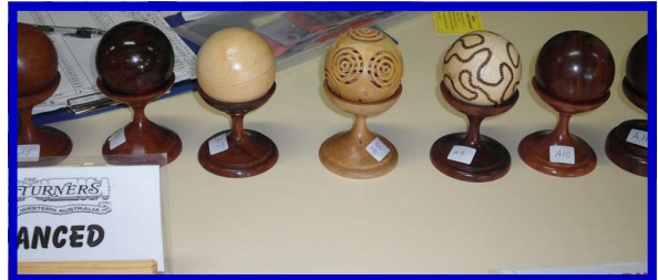
A selection of cups and balls at the Swan Workshop