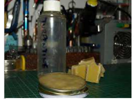
HARD BLOCK: 1 turps to one wax

Allow mixture to cool in old baking tray or tin When the block mix hardens break it up into useable pieces.