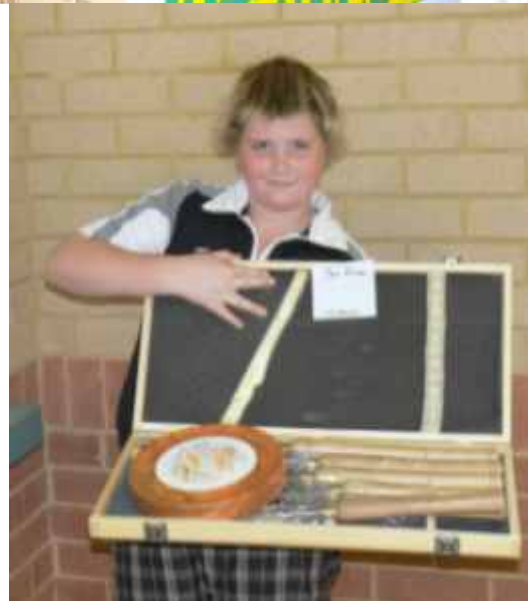
3rd Prize Winner in the Raffle won a Set of Sherwood Woodturning Chisels