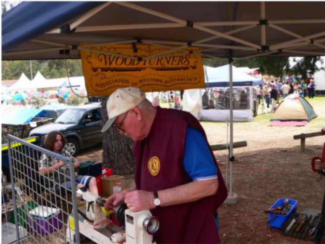
Some of the Swan members demonstrating at the Darlington Arts festival