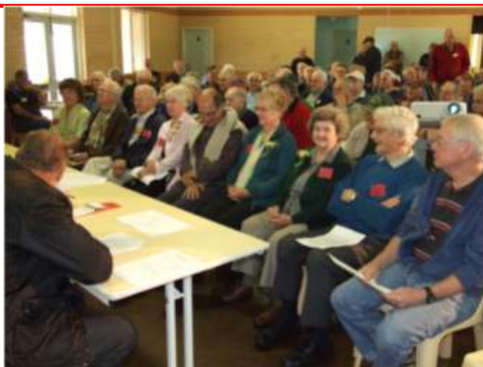
Founding Fathers ( & Mums)

Web site address; http://woodturnerswa.com