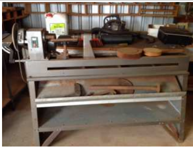
Lathe & stand with accessories - $700