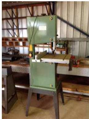
Band Saw Model: MJ343B 750W Capacity: 335x160mm $500.

Contact: Carol Plackett car.joy@icloud.com