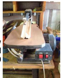
Scroll Saw Rexon 16" 2 speed $120

Contact: Carol Plackett car.joy@icloud.com