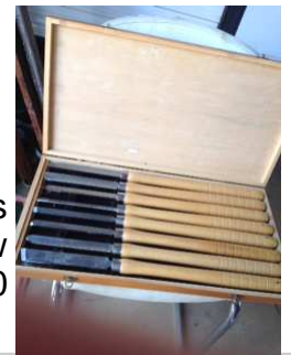
High speed steel chisels Box set of 8, as new $120

FOR SALE AS A LOT - part of a deceased estate, a number of woodturning and wood working tools and equipment is offered for sale. All equipment is in good working order and of good quality. Includes Bormac bench-mounted drill press, Emax air compressor, Clisby compressor, Symtec lathe, Ashby&Abbott bench grinder, Woodfast bandsaw, tools and accessories plus a quantity of wood suited to turning. The lot - $3000 The photos show most of the items. Contact Michele Oakley email: andrewhill@inet.net.au. The items are located at The Vines.