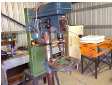
Drill Press Bevel Australia, 16 speed $500