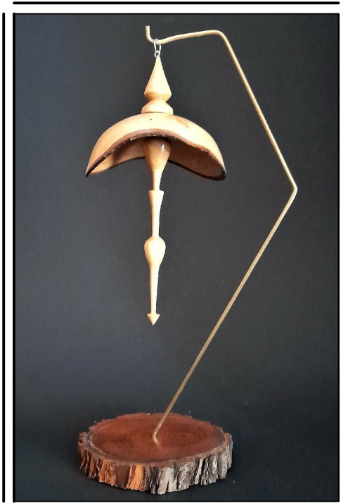
A suspended ornament by Brian Kirkby with natural edge base and umbrella.