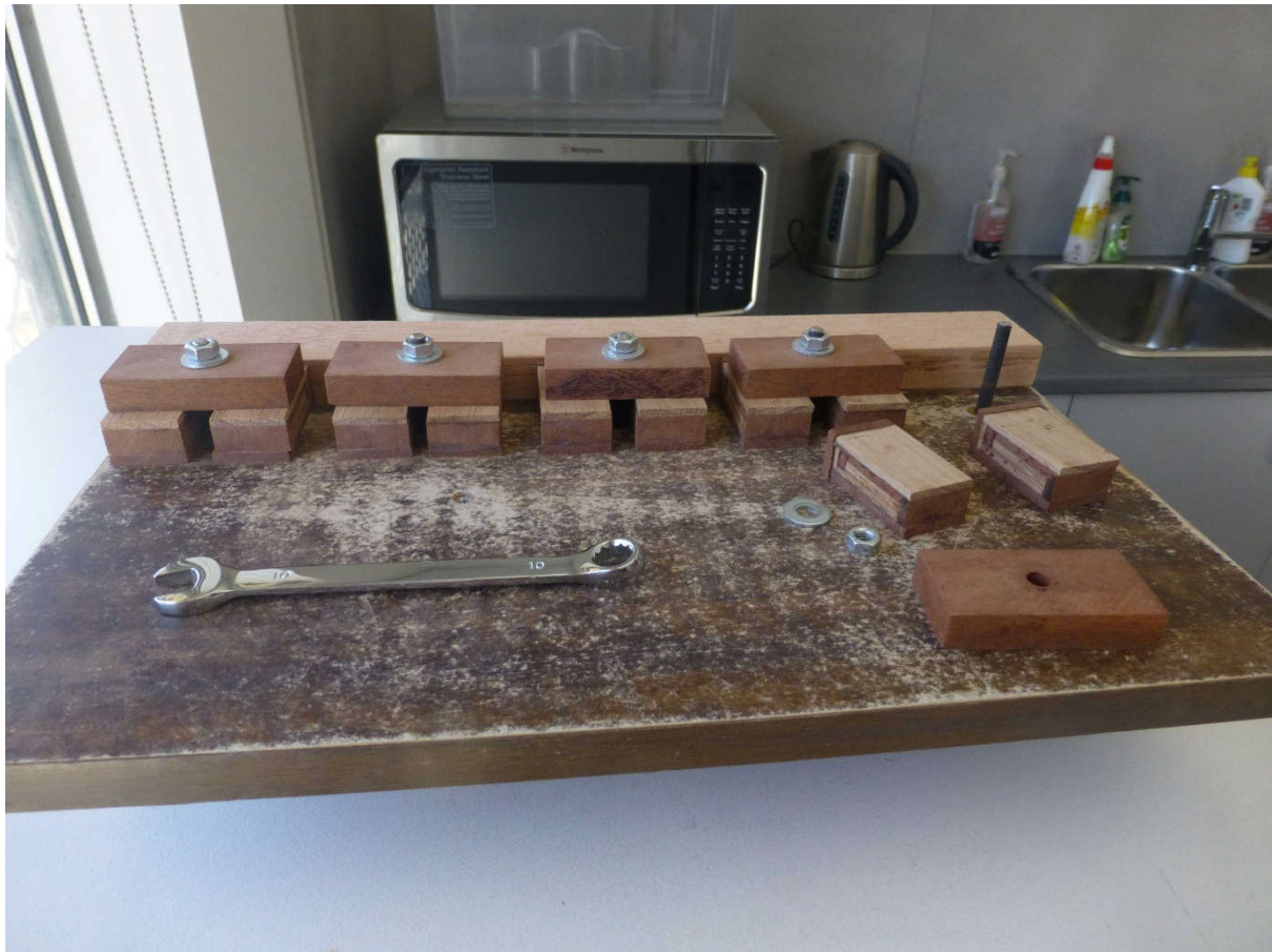
Geoff's Greek Key jig/press.