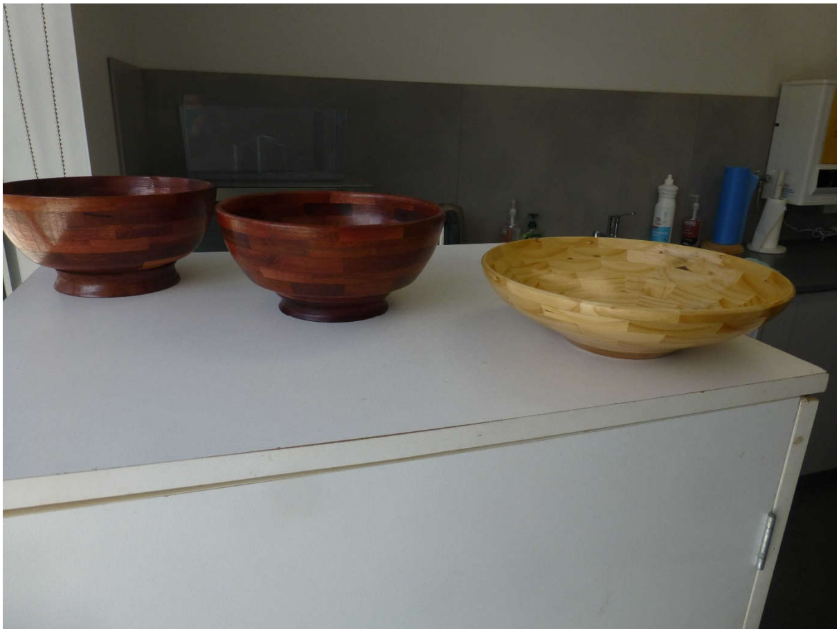
lan, Ross and Aiton brought in their simple bowls. Something very wrong with the shape of Aiton's!