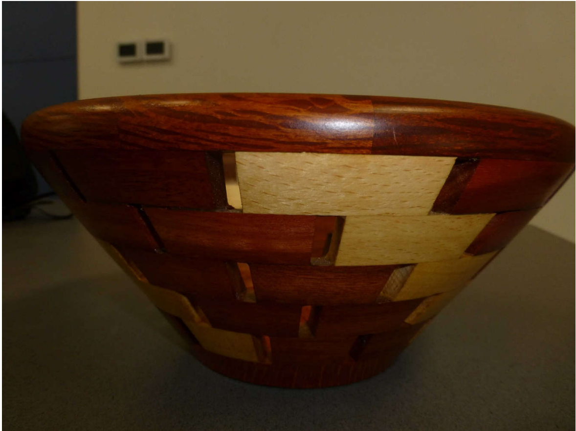
Roger's open segmented bowl