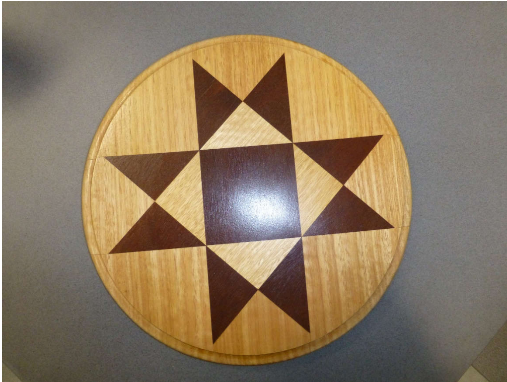
Silvio's diamond pattern trivet and laminated vase.