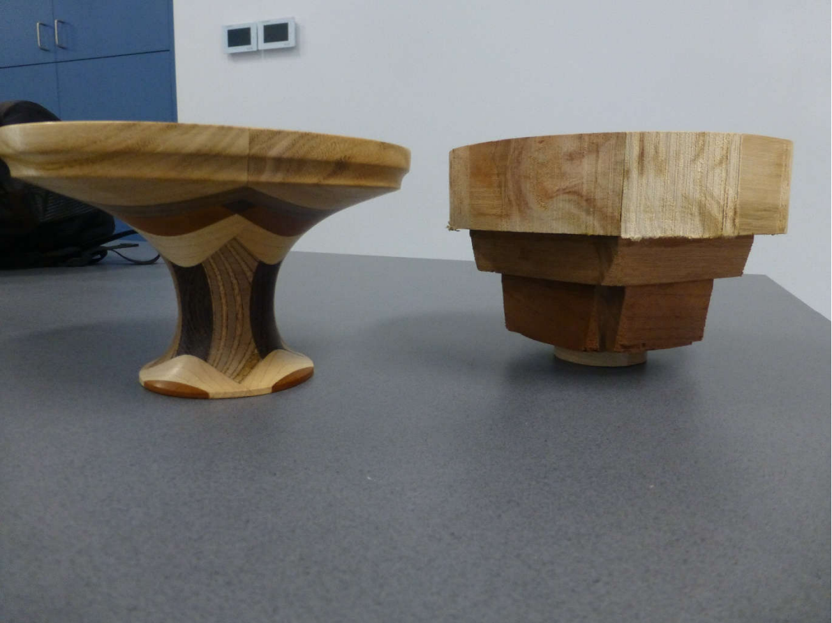
Sylvio's laminated bowls