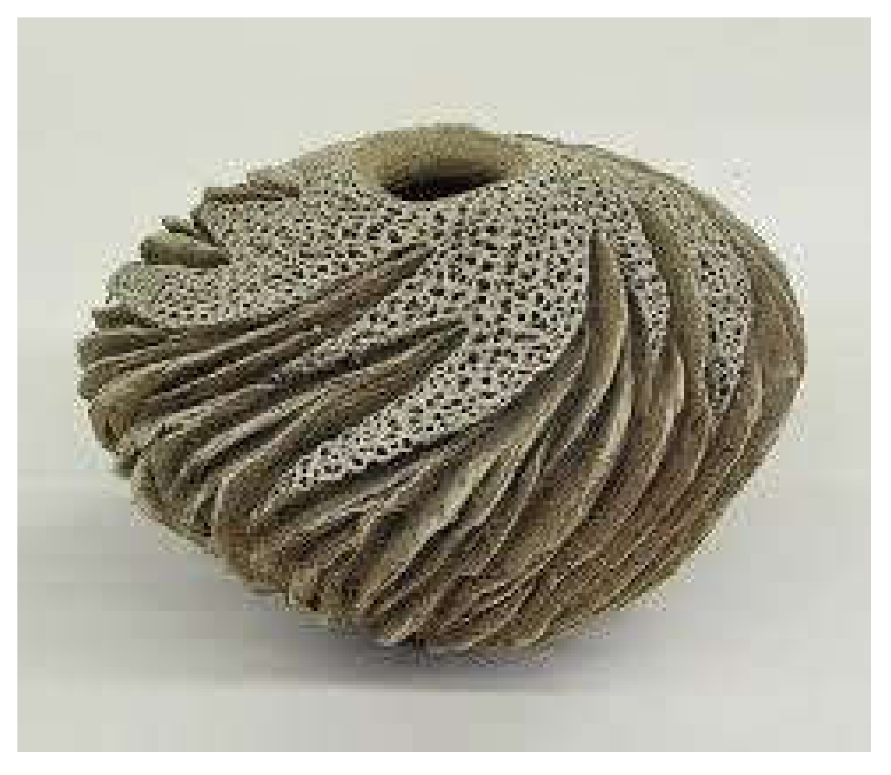
Introduction on 27th May with 10th to 24th June for shaping and carving with final showing on 1st July

Wood size 150mm wide and 110mm high. It could be bigger if you wish but the centre needs to remain in proportion and deeper as shown in the photograph. Be careful with wall thickness as the carving is quite deep. Leave some weight in the base for balance.