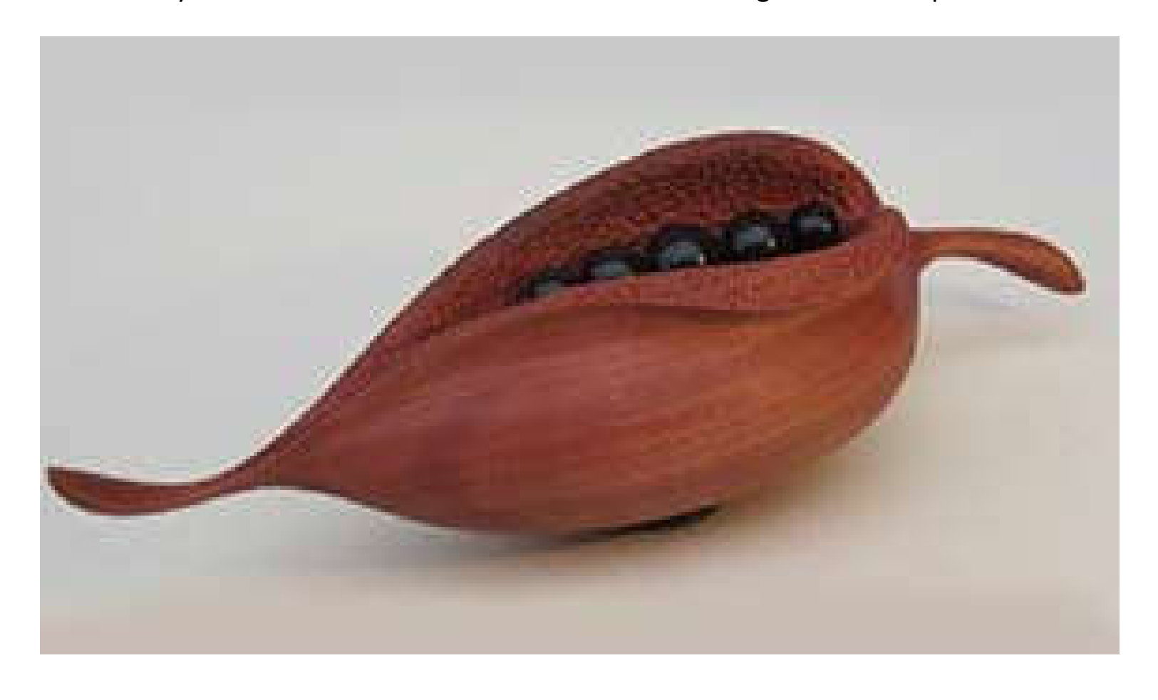
This will be started on 21<sup>st</sup> January. Work shaping and texturing etc on 28<sup>th</sup> January with final showing of completed project 11<sup>th</sup> February

Any timber that is easy to turn and carve can be used. Size 220mm long and 75mm square.