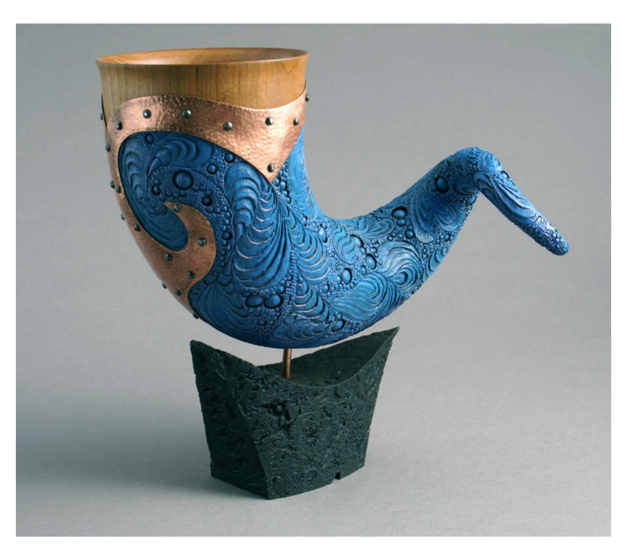
Introduction 8<sup>th</sup> July with shaping and embellishing to start on 22<sup>nd</sup> and 29<sup>th</sup> July with completion on 5<sup>th</sup> August.

Wood needs to be something that is neither highly figured or too hard to carve. As this is simple spindle turning the piece needs to be 200mm long and 75mm square.